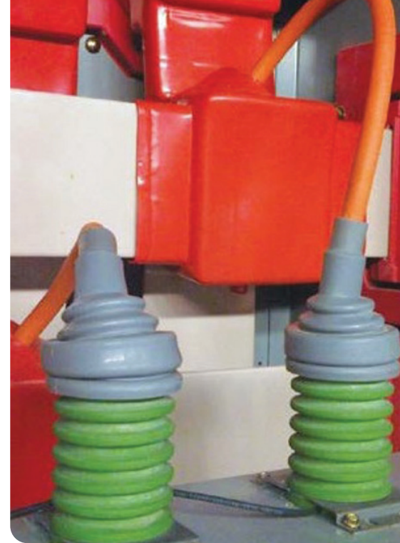
INSTALLED CAPACITIVE COUPLERS

room computer or an Ethernet LAN/WAN. Switchgear and IPB not previously equipped with Iris Power capacitive couplers must have the 80 pF PD sensors installed during a suitable outage.