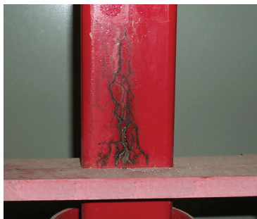
ELECTRICAL TRACKING OF HIGH VOLTAGE BUS DUE TO CONTAMINATION