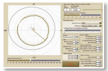
Sample of a polar plot of the data